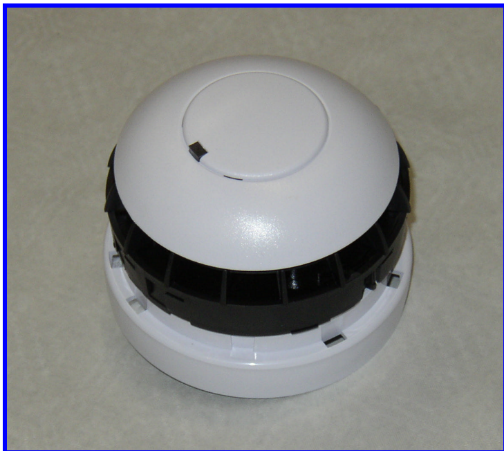
Smoke/ Heat Detector Dimensions